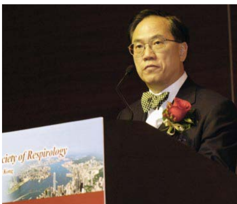
The Honourable Donald Tsang, GMB, JP, Chief Secretary for Administration of the HKSAR, giving his keynote address at the Opening Ceremony

The following are some of the snapshots during the conference.